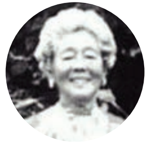
Hawayo Takata (1900-1980)